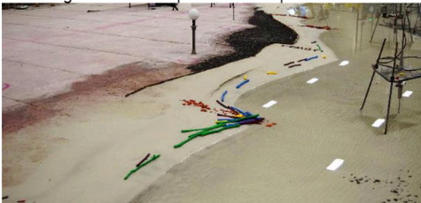
Figure 1 - 1/30 scale physical model at the National Research Council Canada's laboratories in Ontario.

Driftwood plays an important role in coastal ecosystems but, in large accumulations, can have negative impacts and pose hazards to navigation, infrastructure and communities (Murphy et al. 2021). The ability to accurately predict the fate and transport of coastal driftwood is central to informing sustainable management practices. However, there is a paucity of numerical modelling studies focused on driftwood transport in coastal waters (Murphy et al. 2021). Models developed for rivers (e.g. Ruiz-Villanueva et al. 2014) lack consideration of processes affecting driftwood transport and accumulation in coastal environments, such as wind waves. Murphy et al. (2020) conducted experiments in a 50-m by 30-m wave basin, wherein model driftwood was released and tracked within a 1/30 scale physical model of a sandy beach system with various coastal structures (Fig. 1). The tests revealed that several factors influence the mobility of coastal driftwood exposed to waves, beaching and washoff processes in particular.