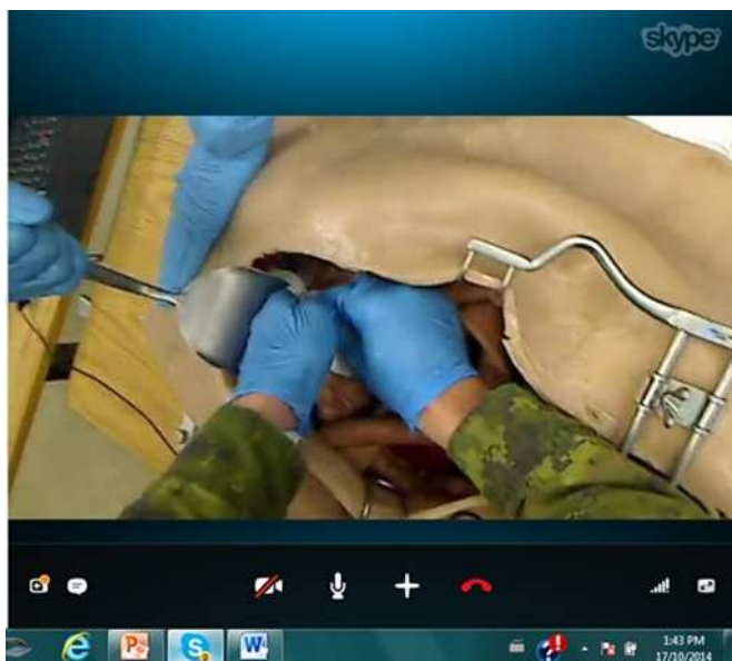
Figure 1. Remote mentor's screen illustrating the surgical simulator as viewed through the MedTechs head-mounted camera.

has been limited progress in developing techniques to control exsanguinating truncal hemorrhage in the pre-medical treatment facility environment, other than admonitions to decrease the time from point of injury to surgical intervention. 1