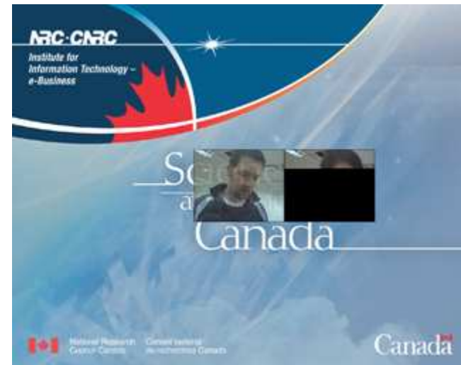
Figure 2. Screenshot showing earlier image fading and current image partially processed.

Figure 2 shows the display on the exhibit's monitor. Two images are currently displayed: a completed image and a partially processed image. The amount of the partially drawn image shown represents the amount of data transferred to the CPU and processed. This image is located to the right of the initial image with subsequent images spiralling around the first image until the screen is full and the initial image – if still visible – is replaced. Once an image has been fully processed a new computer configuration can be selected and the task can be repeated with a new image.