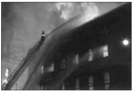
Figure 1. If all occupants heed the fire alarm and move to safety, firefighters can focus on controlling the fire.

The degree to which these objectives are met varies widely and depends on the building and the occupancy. Schools, for example, appear to have a high degree of compliance to fire safety rules and procedures. When the fire alarm goes off in an elementary school, it is standard practice for all pupils to leave in ranks with their teachers and gather on the playground. In