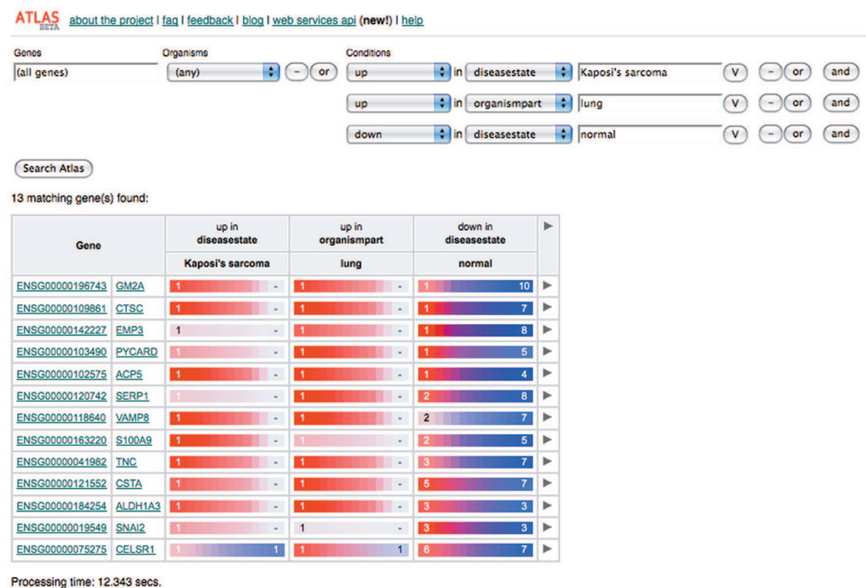
Figure 3. ArrayExpress Atlas advanced query interface showing all genes up-regulated in Kaposi's sarcoma diseased lung tissue and down-regulated in normal samples.

cell (Figure 3). More complex queries combining several conditions are available via the advanced Atlas interface. The Atlas data content is produced using a meta-analytical approach which uses the Bioconductor module limma (7). It is applied to each experiment in the ArrayExpress Warehouse to calculate moderated t statistics that simultaneously test the significance of differential expression in each condition versus the mean level of expression across all conditions for each gene. We then adjust the computed P -values to control the false discovery rate, using the Benjamini–Hochberg method (8), and aggregate the computed multiple test statistics for interpretation. The high quality of annotation and curation of experiments in the ArrayExpress Warehouse allows the application of this generic method to data from multiple platforms. Although the majority of the Atlas data at present is on the Affymetrix platform, the method is platform independent, and the Atlas also includes data from two-channel arrays. The ArrayExpress Warehouse and Atlas have a monthly data release with data derived from the ArrayExpress Repository content. Each release includes new experiments and a complete re-annotation of the genes present based on Ensembl and Uniprot, together with updated gene rankings.