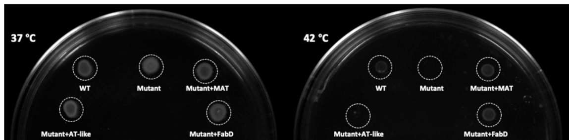
Figure 2. Plate complementation test of the AT-like domain in an E. coli fabD mutant grown at permissive (37 °C) and non-permissive (42 °C) temperatures. WT: parental wild type with the empty vector; Mutant: the mutant with the empty vector; Mutant+MAT: the mutant with authentic MAT domain from Subunit-A; Mutant+AT-like: the mutant with the AT-like domain from Subunit-B; Mutant+FabD: the mutant with E. coli wild-type MAT gene ( FabD ).