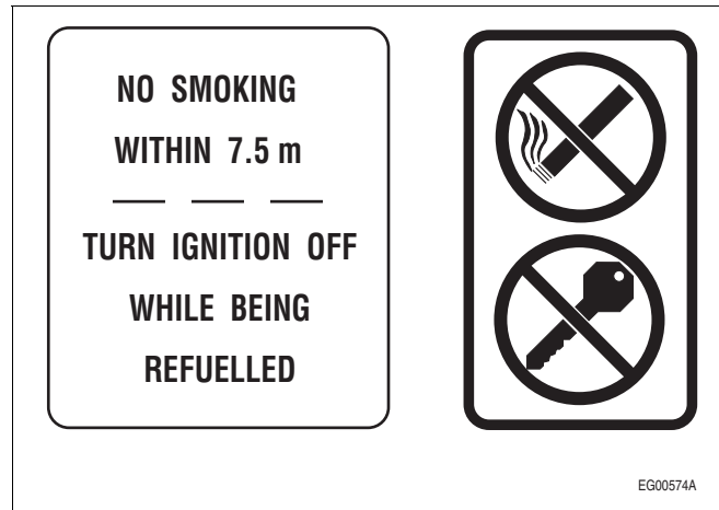
Figure A-4.6.8.8.(2) Fuel-dispensing station signs

A-4.7.4. When used in this Subsection, the terms “loading” and “unloading” shall mean the loading and unloading of tank vehicles or tank cars.