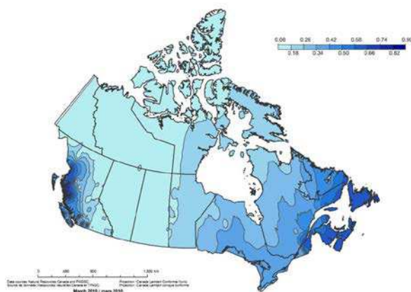
Figure 3. Canadian design data for annual snowload (rain-on-snow) - 50 year return period (KPa)