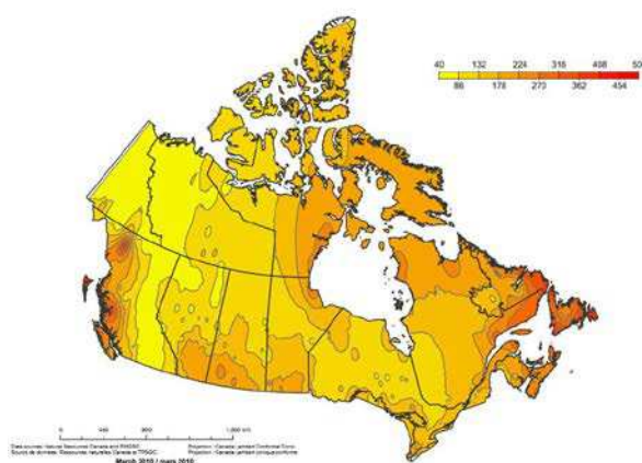
Figure 4. Canadian design data for driving rain wind pressure - 5 year return period (Pa)