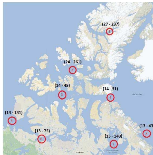
Figure 2. Merged exposure time ranges (based on all Canadian resources).

The lowest reported estimated exposure time is 13 hours (air-based SAR response at locations 6 and 8) which can be considered the minimum amount of time one can be expected to be exposed to the Arctic environment.