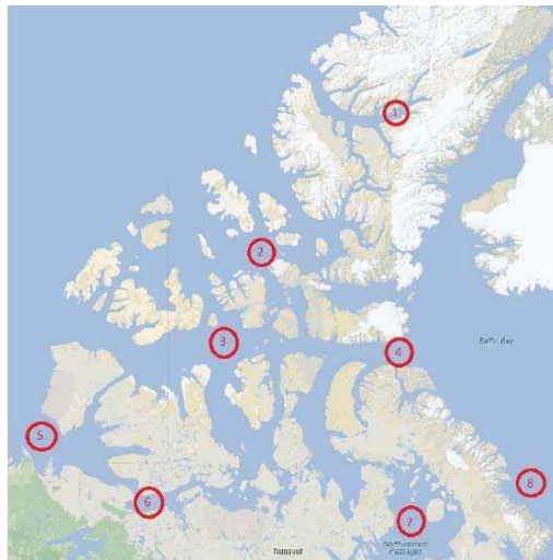
Figure 1. Locations used to estimate exposure time in the Canadian Arctic.

Based on current and prospective marine traffic, eight different locations in the Canadian Arctic were chosen as potential areas where an accident could occur (Figure 1).