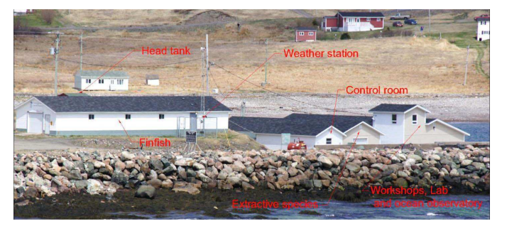
Fig. 2. The Wave Energy Research Centre in Lord's Cove.

Abstract—The collapse of the Atlantic cod fishery in the 1990s devastated the economies of many coastal Newfoundland communities. While many have survived through a combination of a much reduced fishery, government funding, and off shore or out of province employment, none of these are sustainable longterm solutions. Sea-based aquaculture ("fish farming" in pens) has provided stable employment in some areas, but only where there are suitable sites with protected, deep inlets with significant tidal or river current flushing. These geographic characteristics are not usually compatible with prosecuting the inshore fishery. Sites that were close to the open fishing grounds with minimal near shore currents were prized by the small boat fishers, but wind and wave protection were a secondary concern. Thus there are many towns and villages that are significant distances from ideal sea-based aquaculture sites.