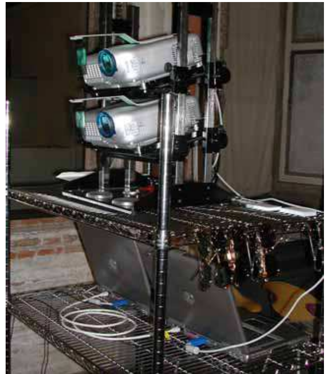
Figure 2. Visualisation system setup with laptops and DLP video-projectors.

In this section, we describe a cost-effective approach for the stereo visualisation of virtual sites. When a site is virtualised, it is possible to make it available to a large variety of people, as far as the intellectual property protection allows.