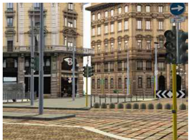
Figure 1. Visualisation of Piazza Cordusio in Milano; model with textures rendered with the virtual theatre.

The use of 3D models has been for years the object of investigation in the field of territorial representation as well as the inter-connected field of event simulation. With the introduction of programmes for automatic design, the usage of numerical models has attempted to replace their physical and studio homologues [9]. Consequently, the use of simulators that are more or less automatic has tried to create the right conditions to generate urban environments. Nevertheless, these programmes, based upon pre-defined libraries, find it hard to adapt to the morphological features of most Italian and European cities. Many Italian cities like Florence, Milan or Rome call for detailed and well-articulated models with particular characteristics that cannot easily be standardized.