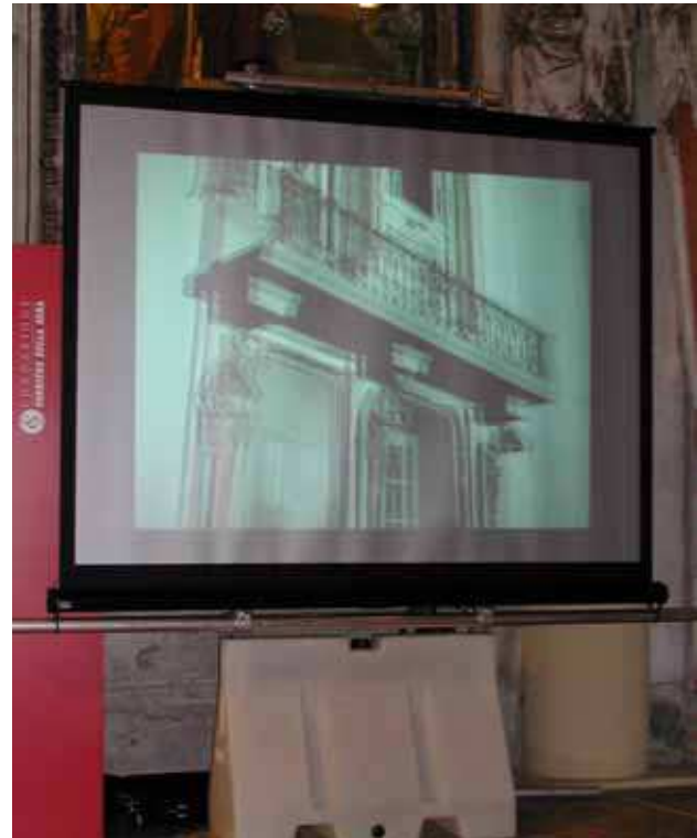
Figure 3. Visualisation of a portion of the Sala delle Cariatidi in Palazzo Reale a Milano. Partial view of the restored model with an added balcony.

wavelengths, which means that the colour distortion is reduced to a minimum. This is an important aspect to ensure the faithfulness toward the original.