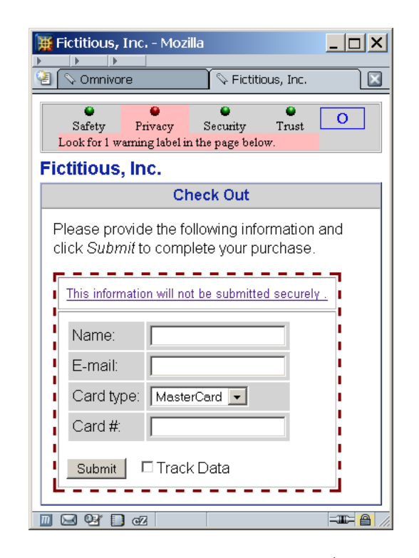
Figure 2: Clicking on a red indicator (the Privacy indicator in this case) toggles the display of additional information.

The design of the Omnivore system is inspired by a combination of ideas from the AT&T Privacy Bird developed by Cranor et al. [3] and the safe staging approach of Whitten and Tygar [7]. The Privacy Bird is a plug-in for the Internet Explorer browser that uses a traffic light metaphor to communicate privacy related information. For each site visited by the browser, the plug-in attempts to obtain the P3P privacy policy statement for the site and compare it with privacy preferences the user has configured. If the policy respects the user's preferences, a small green singing bird icon is displayed in the title bar. If a conflict with a user's preferences is detected, the bird turns red (and swears). You can obtain a concise description of the situation by clicking on the red bird icon. If the plug-in is unable to make a definite determination for any reason, an orange bird is displayed.